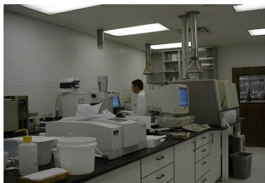
Compliance GT technology is fully supported by a Research and Development Lab.

Alpine Technical Services is pleased to introduce an innovative and cost-effective solution to this problem. Compliance GT is a non-enzyme, chemical formula which separates fats, oils and greases from wastewater while simultaneously raising its pH level.